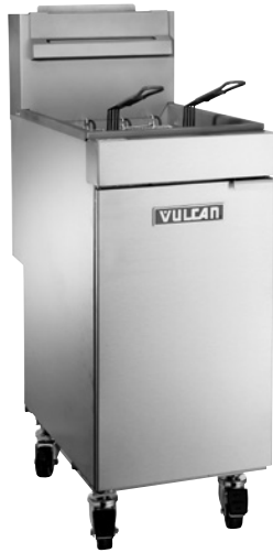
Model LG300 Shown with caster accessories