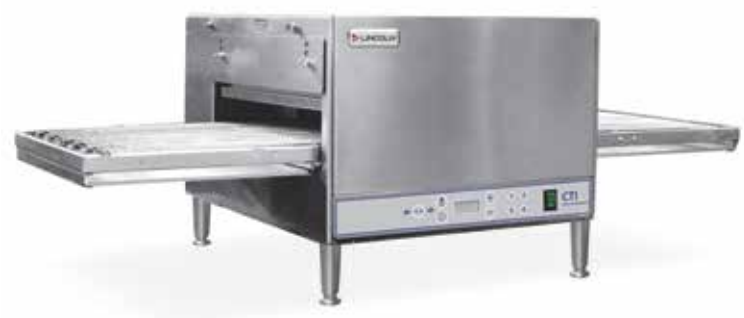
Shown with 50" (1270 mm) extended conveyor.